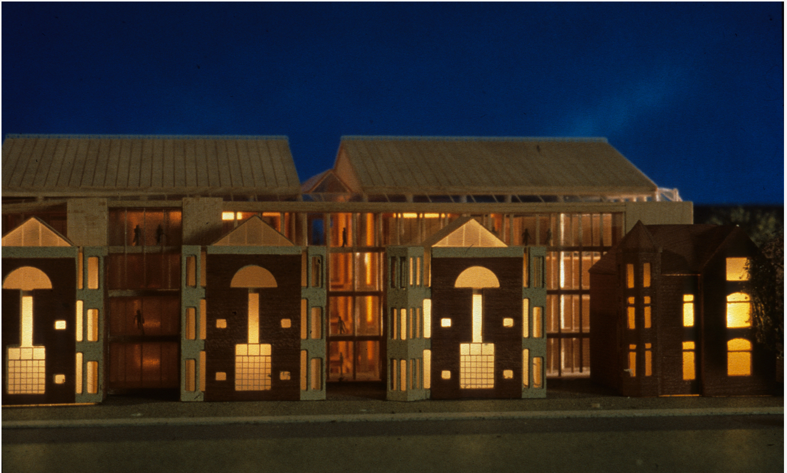
Queen's University Library 1 Elevation view of model