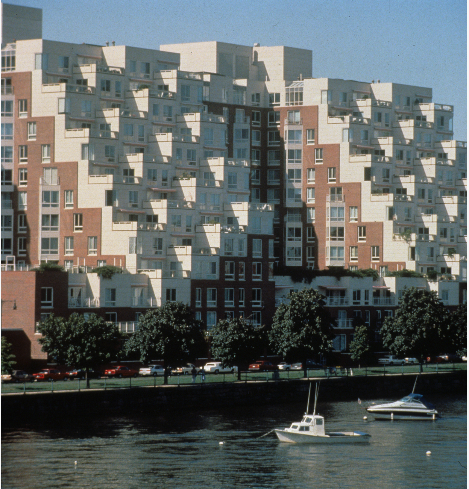
Esplanade Condominiums 1 View from Charles River