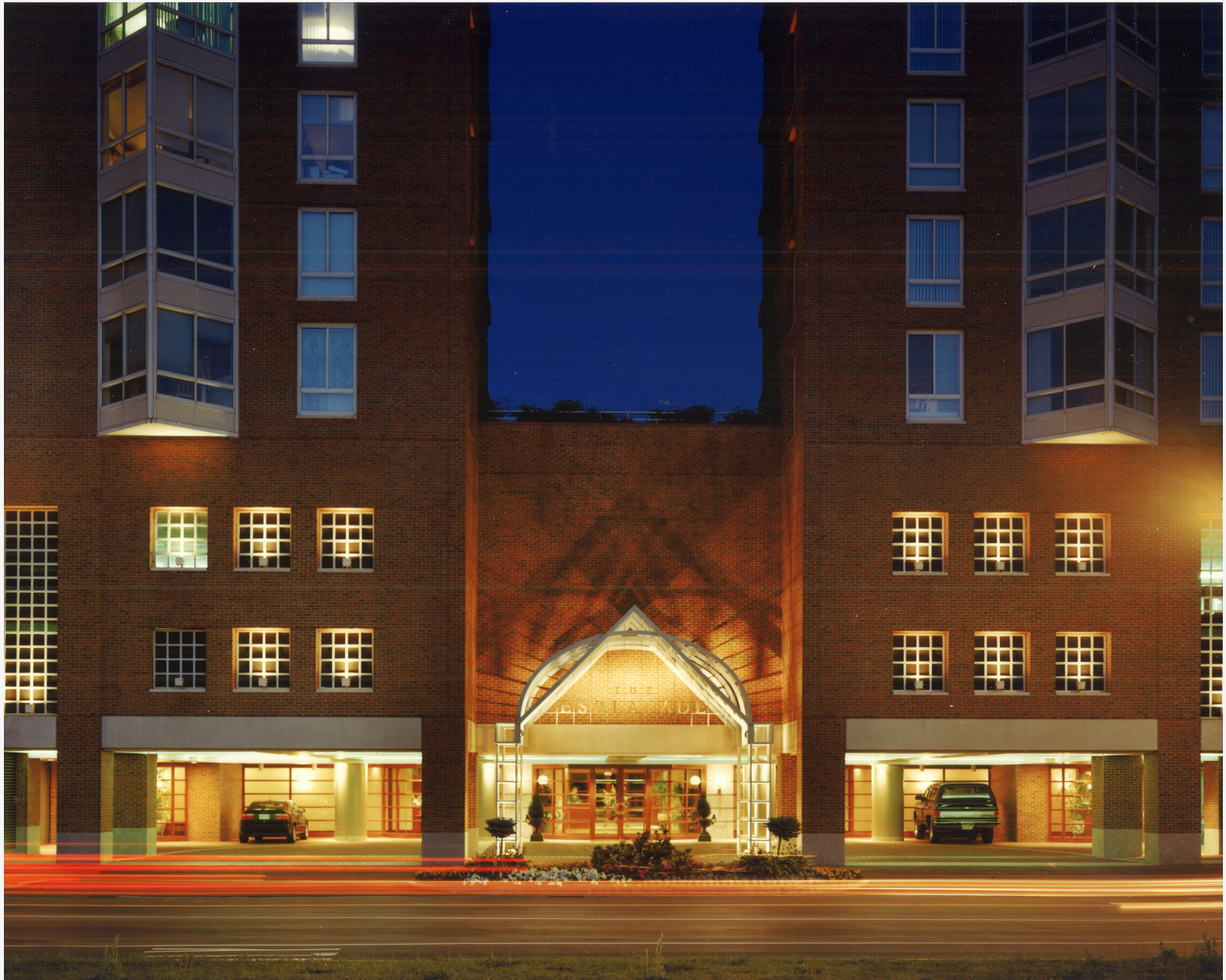
Esplanade Condominiums 2 Entrance lobby with glazed roof