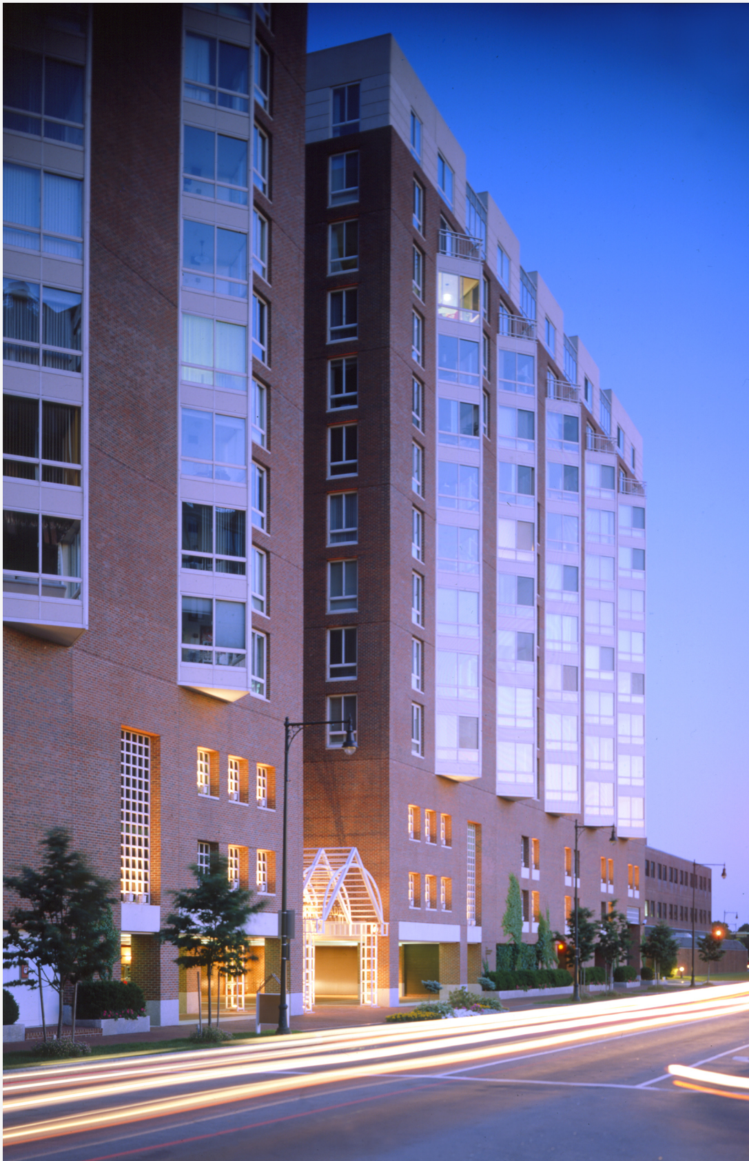
Esplanade Condominiums 3 Bay windows along street