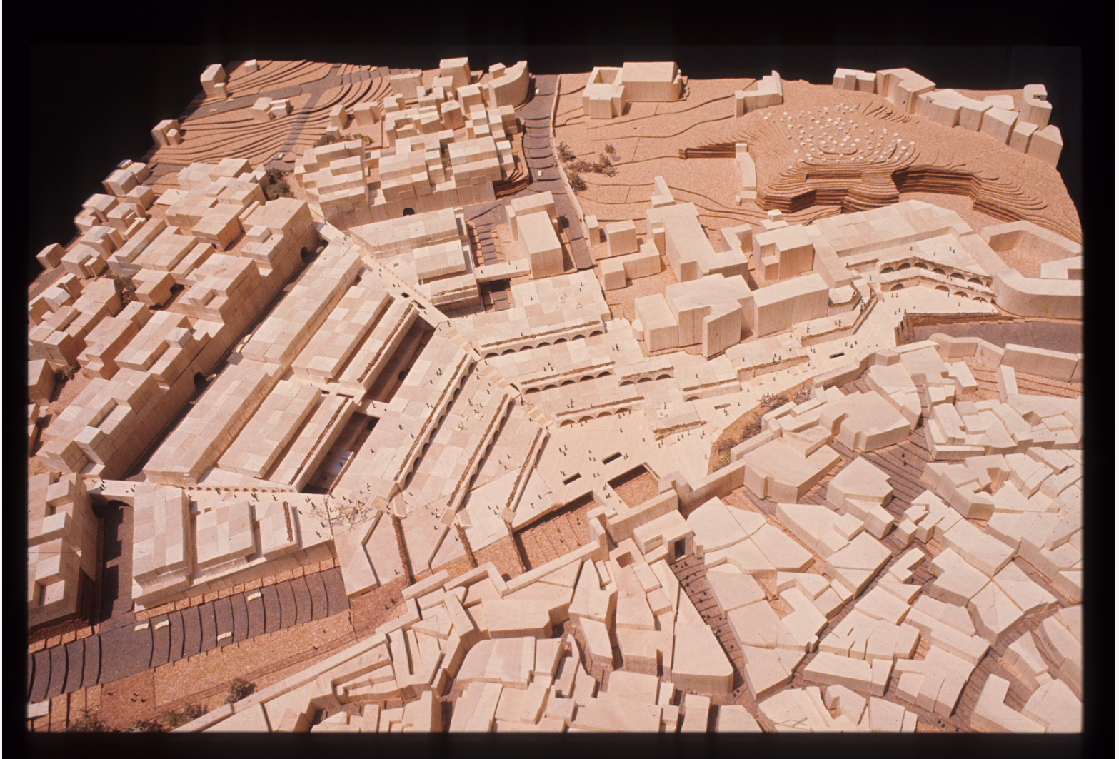
Damascus Gate Scheme 1 - Fan 3 View of physical model