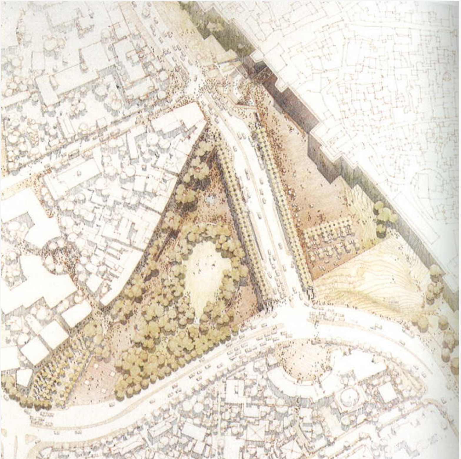
Damascus Gate Scheme 1 - Fan 4 Upper level plan