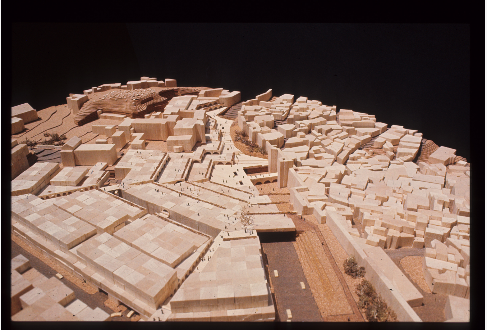
Damascus Gate Scheme 1 - Fan 2 View of physical model