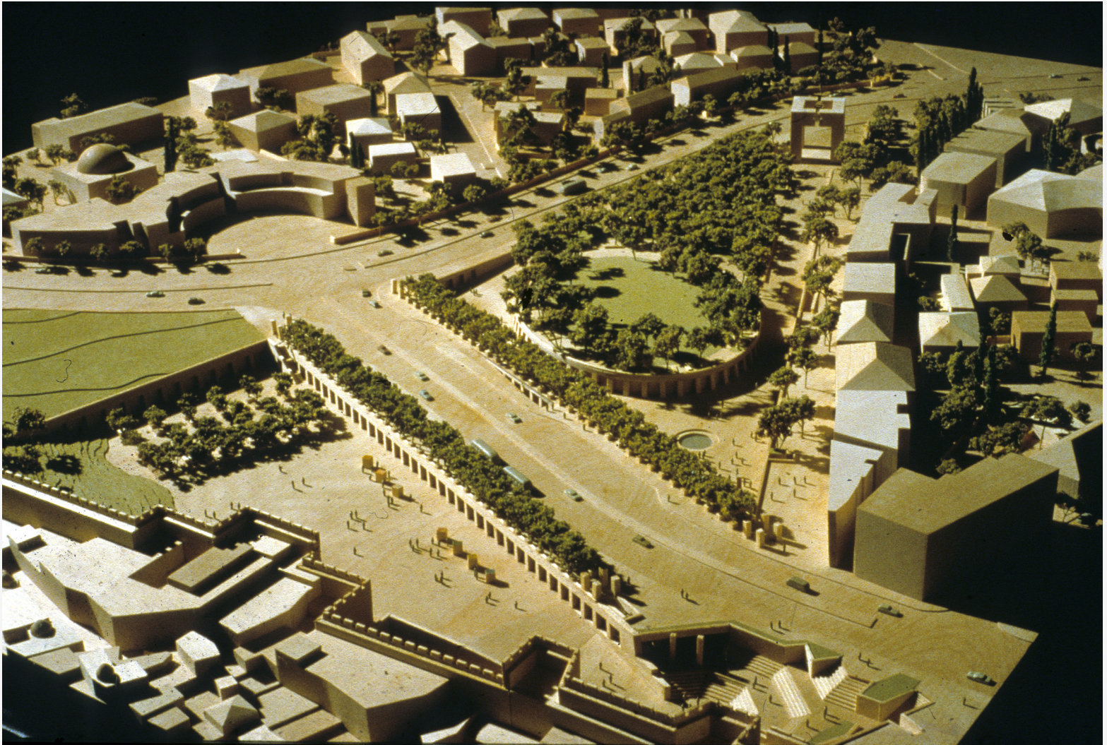
Damascus Gate Scheme 1 - Fan 1 Aerial view of physical model