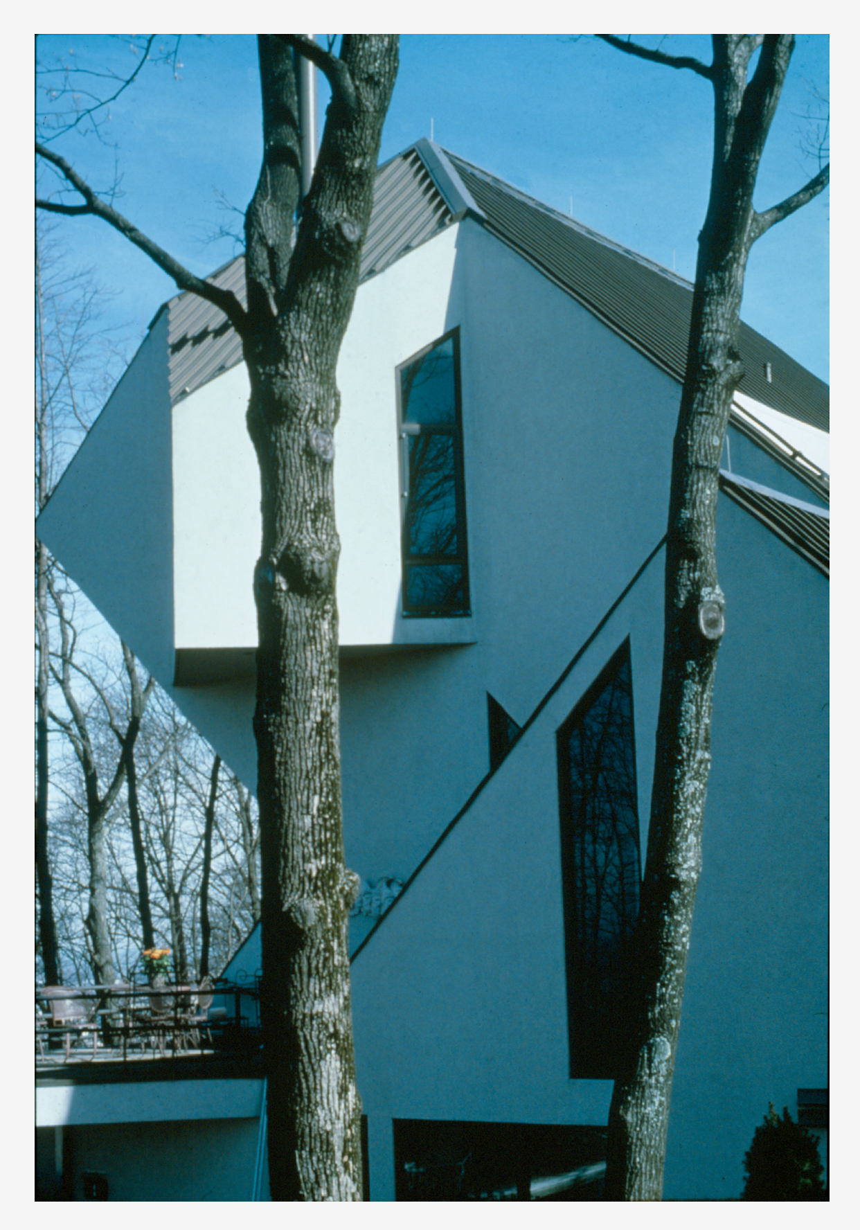
Callahan Residence 4 Wall detail