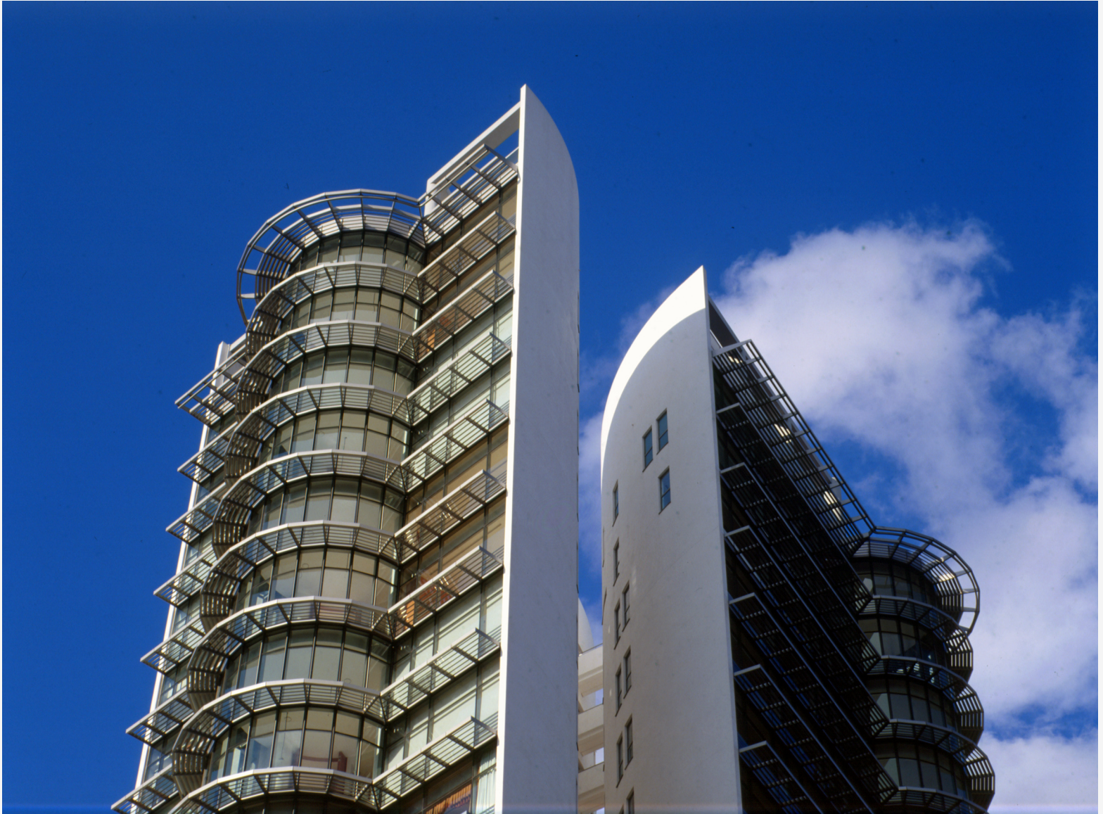
Cairnhill Road Condominiums 1 View from ground level