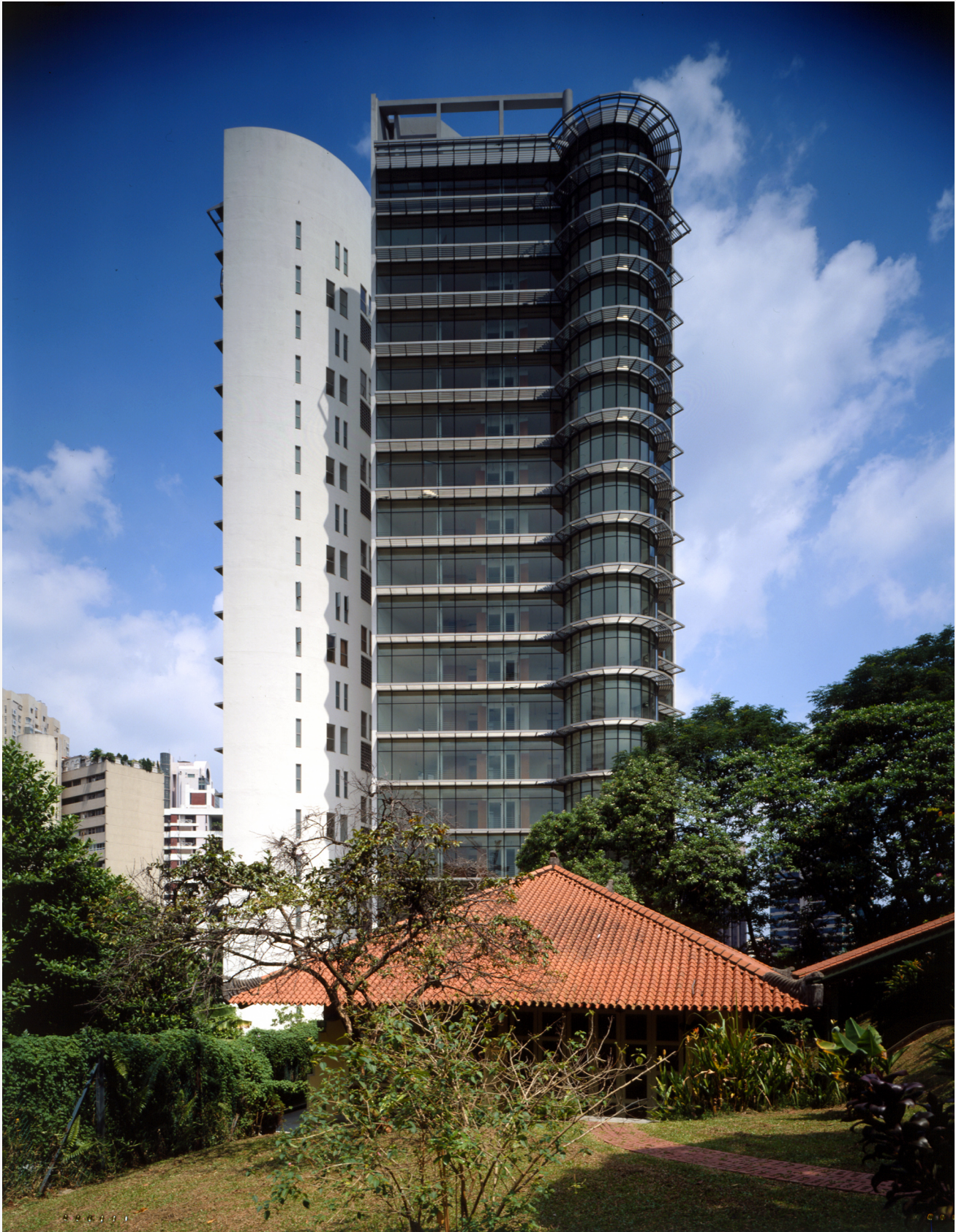
Cairnhill Road Condominiums 2 Façade view