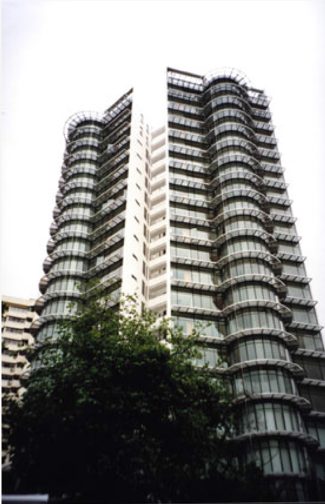
Cairnhill Road Condominiums 3 View from ground level