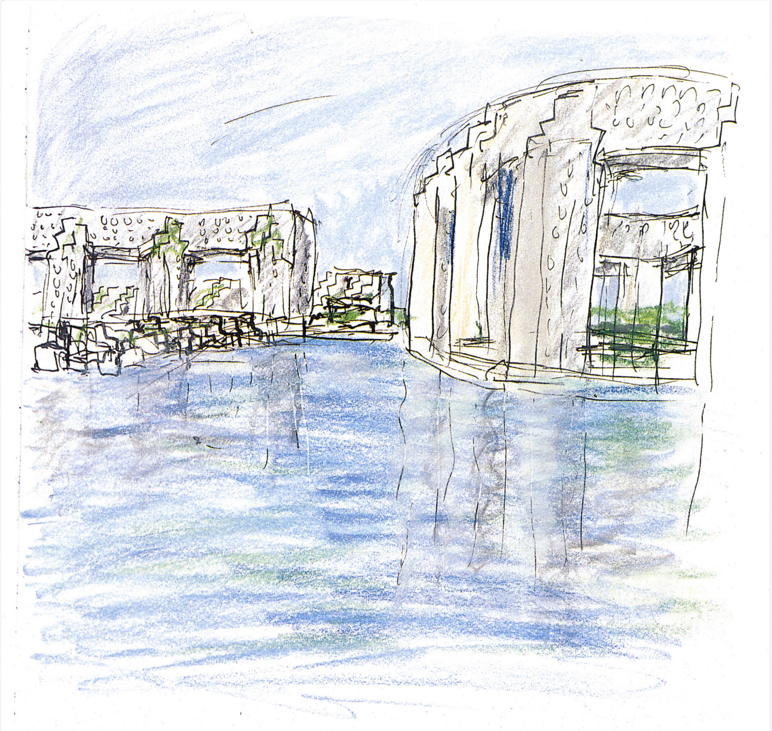
Simpang New Town 5 Sketch studying variations on high-rise edge housing