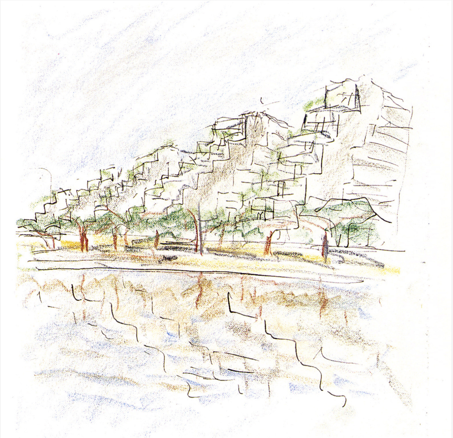
Simpang New Town 4 Perspective sketch of stepped housing along urban edges