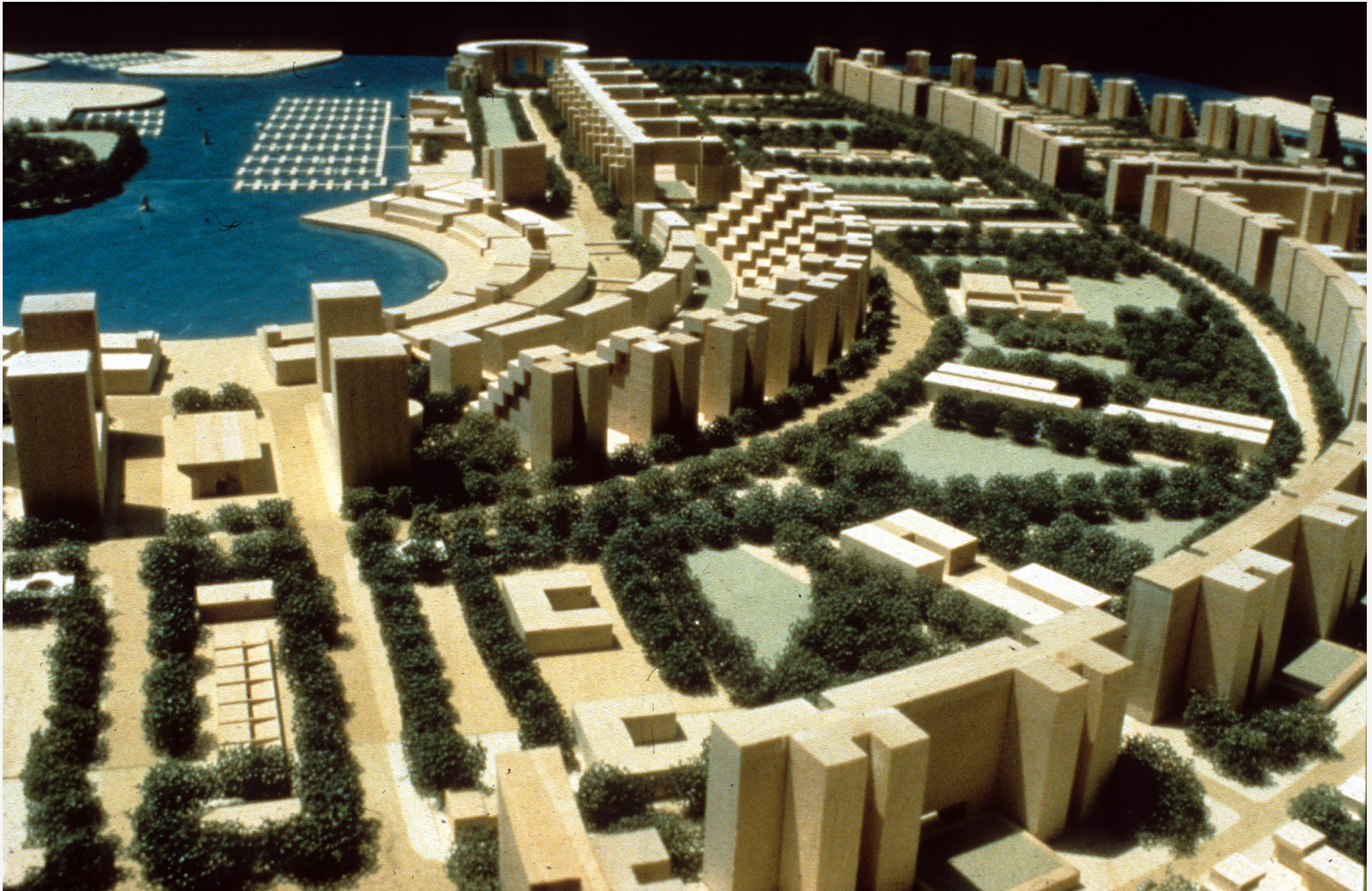
Simpong New Town 1 Aerial view of physical model