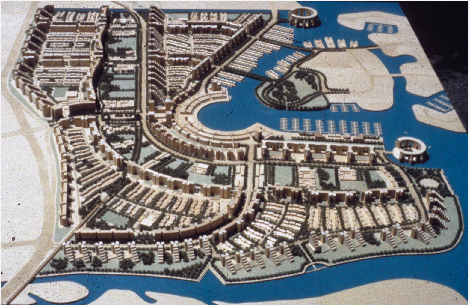
Simpong New Town 2 Aerial view of physical model