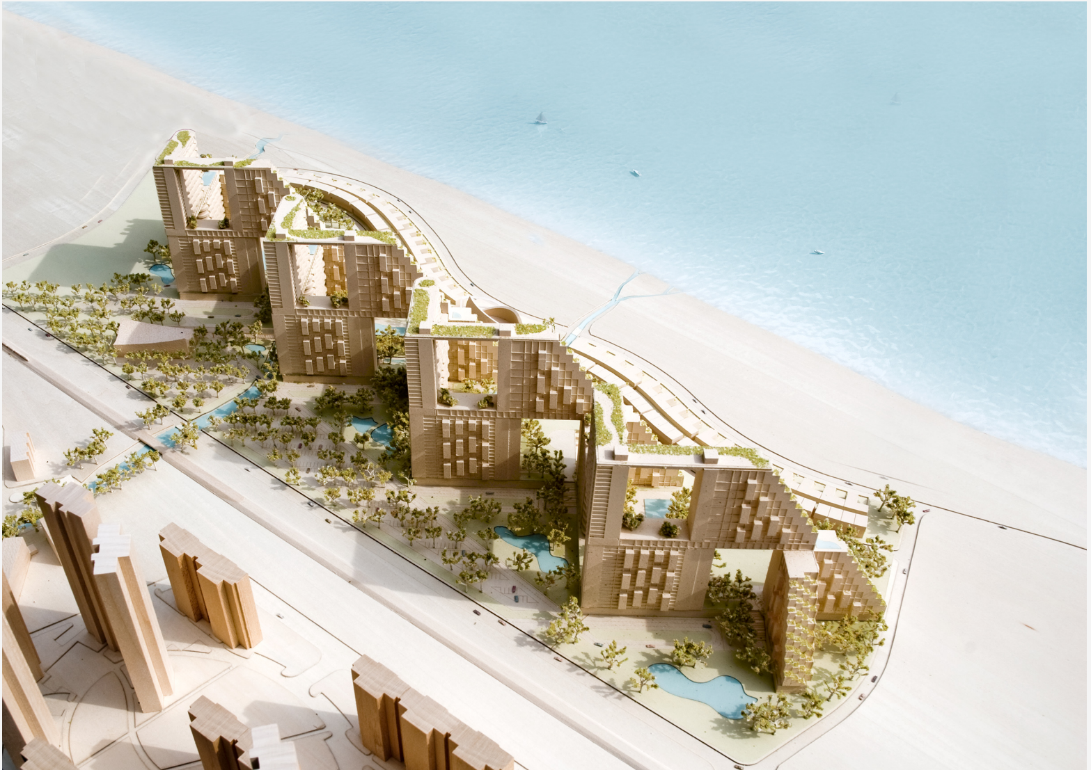
Qinhuangdao Golden Dream Bay 3 Aerial view of physical model