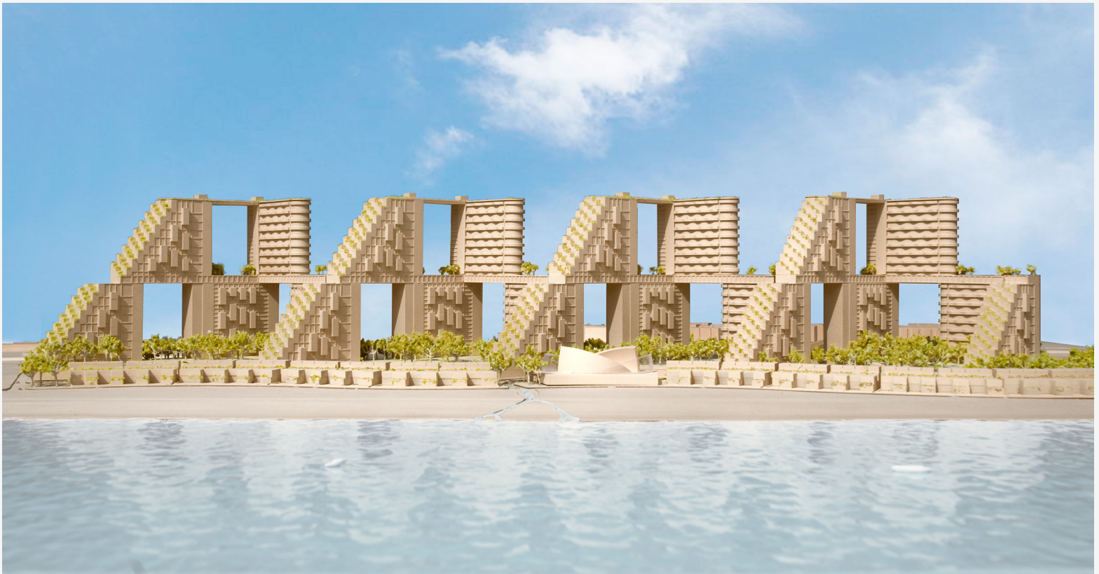
Qinhuangdao Golden Dream Bay 2 Physical model