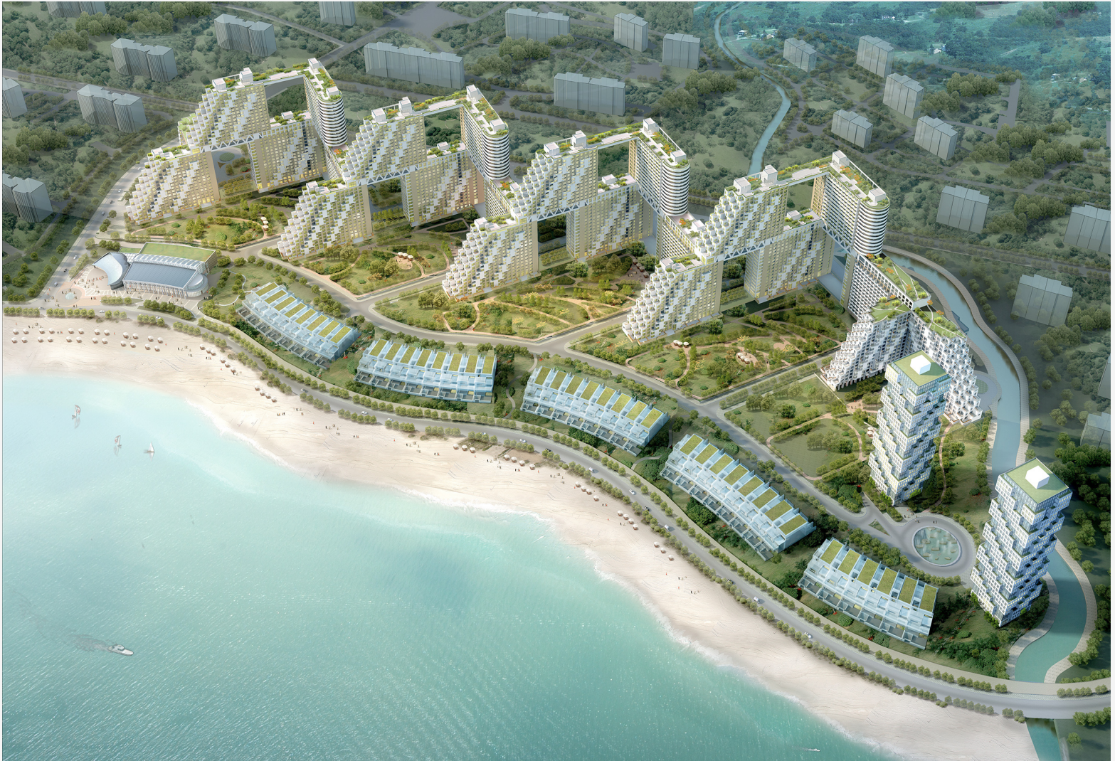
Qinhuangdao Golden Dream Bay 1 Aerial view of waterfront development